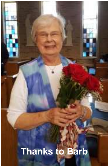
Thanks to Barb