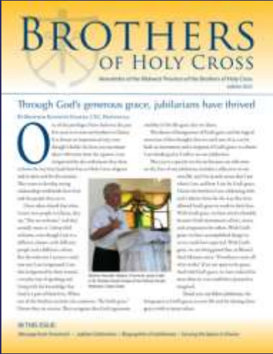
Brother Jubilarians for 2022