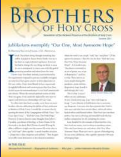
Brother Jubilarians for 2021