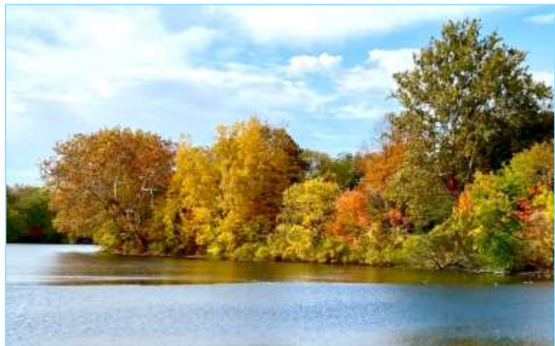
Saint Mary's Lake, Notre Dame

Psalm 19-1 The heavens declare the glory of God; the skies proclaim the work of his hands. Day after day they pour forth speech; night after night they display knowledge. There is no speech or language where their voice is not heard.