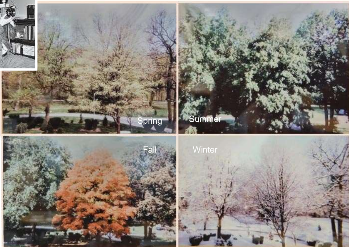
Photo of the same view at four different seasons. The view is of the back area looking northwest from Columba Hall toward Saint Joseph Lake. This past year the beautiful maple tree (middle of picture) had to be taken down.