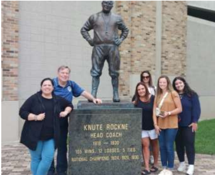
Some of the Hoban faculty members at the Knute Rockne statue