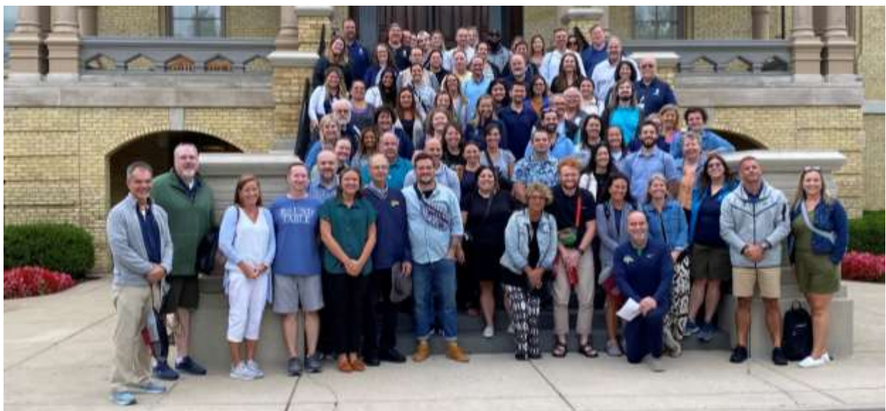
Hoban faculty on the steps of the Administration Building following the 11:30 Mass.

While the retreat day was a long one, most faculty discovered a greater appreciation of Holy Cross education in the United States striving to carry on the vision of Blessed Basil Moreau.