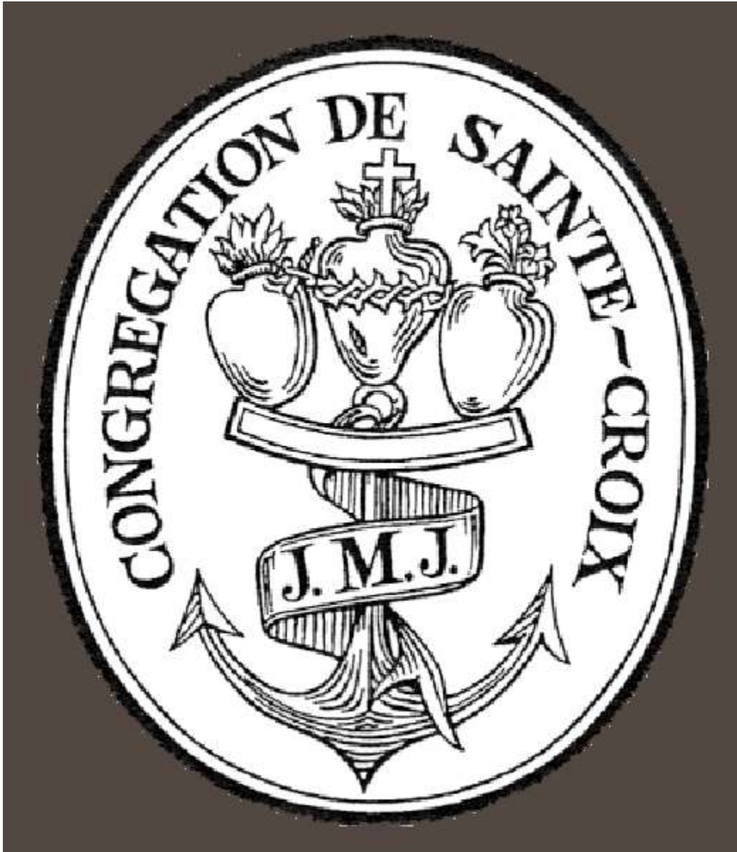
Seal of the Congregation of Holy Cross An Original Symbol Design

https://www.holycrossusa.org/about-us/seal-3/