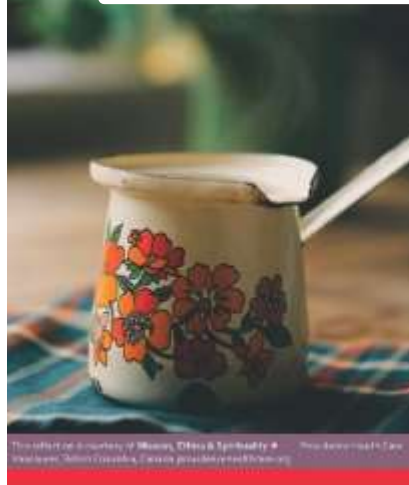
The gift of a jar of Muesli, Oats & Spirituality. Providence Health Care. Vancouver, British Columbia. Canada. providencehealthcare.org

"I slept and dreamt that life was joy. I awoke and saw that life was service. I acted and behold, service was joy." ~ Rabindranath Tagore