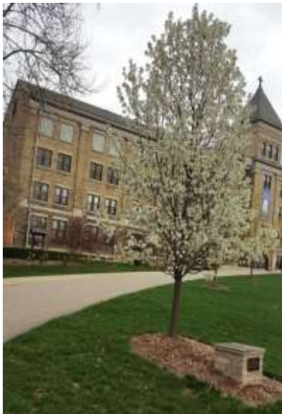
MWHCA – Pear Tree – Columba Hall

Spring Teleconference Sponsored by the Midwest Holy Cross Associates Saturday, April 24, 2021