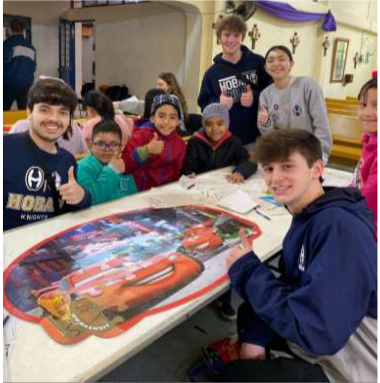
Party for PSR class