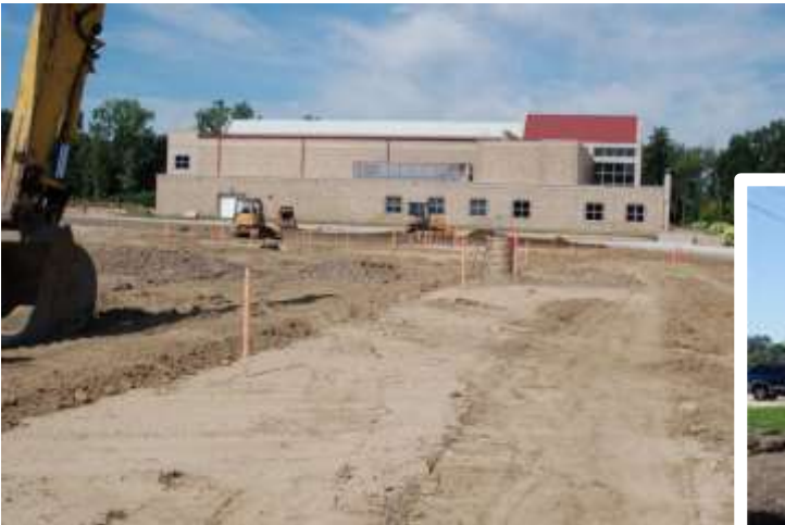
Parking Lot Construction