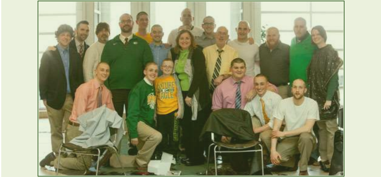
Shaving Their Heads.

St. Edward Students Raise Over $9,000 for the St. Baldrick's Foundation by