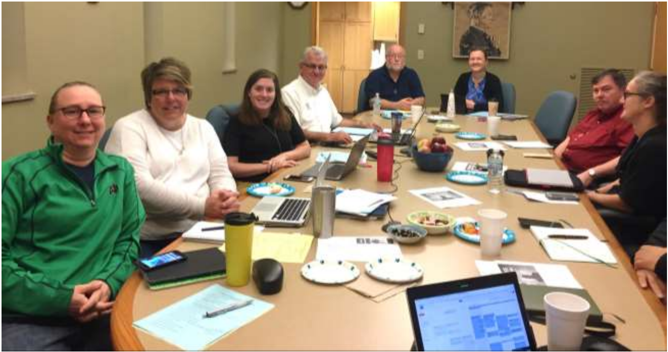
Campus Ministers from Holy Cross Midwest schools met at the Holy Cross Administration Building, Notre Dame.