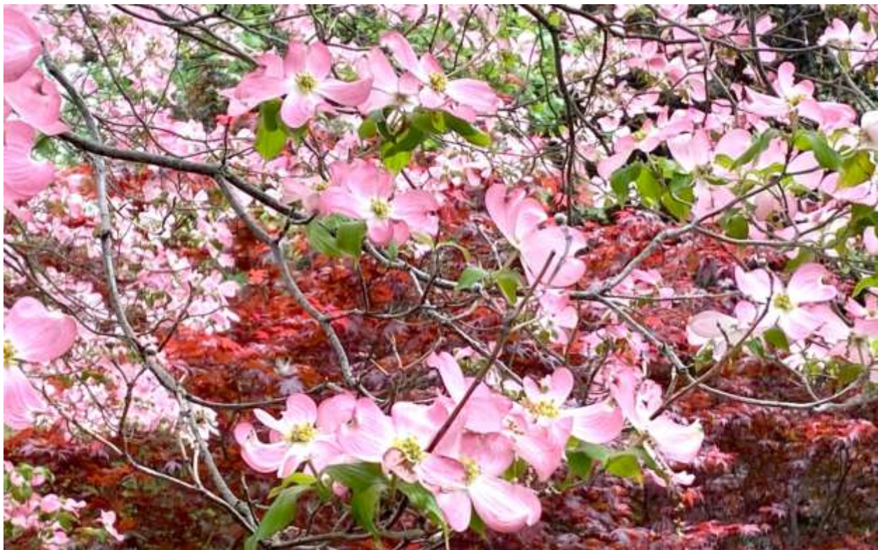
Snapshot of the Columba Hall backyard Dogwood tree backed by the deep red of the Japanese Maple.