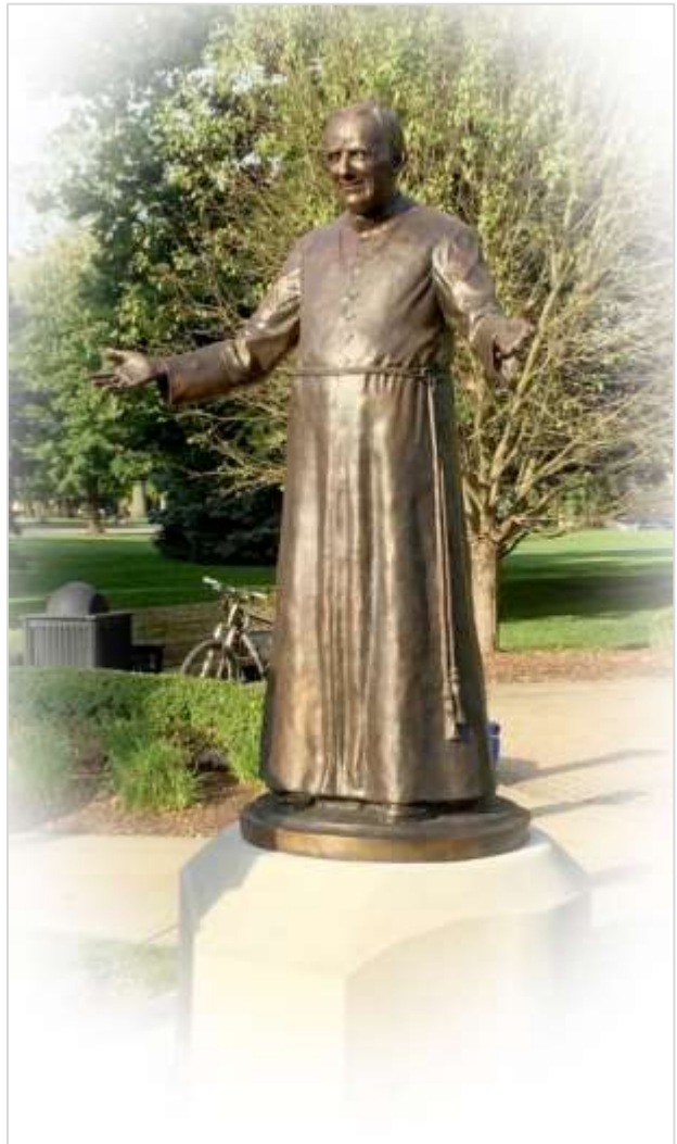
A Welcoming Brother André

https://www.vatican.va/news_services/liturgy/saints/ns_lit_doc_20070915_moreau_en.html