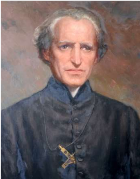
Blessed Father Basil Anthony Mary Moreau

Click link below for history of Holy Cross and Fr. Moreau .