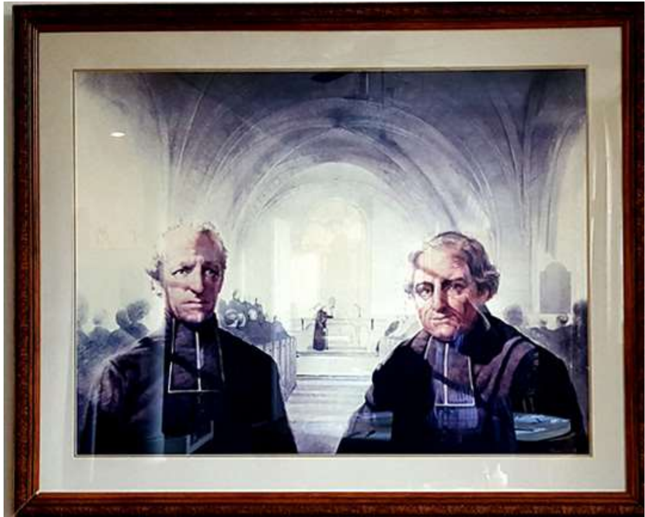
Blessed Basile Antoine-Marie Moreau