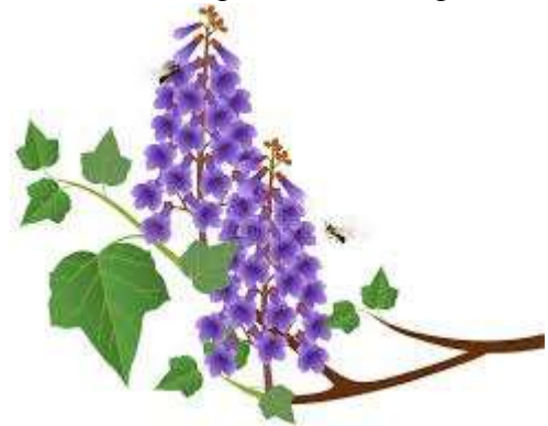
Paulownia Tree Tree planted in front of school

Because of the ever present Brothers and their "neighborhood" school, we were involved in sports and music and always "on call" if an usher, singer, or dancer were needed. Many of us, just like the orphans at the old Notre Dame Trade School, were beneficiaries of the quiet and seldom publicized work of the Holy Cross Brothers.