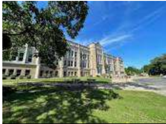
Reitz Memorial High School