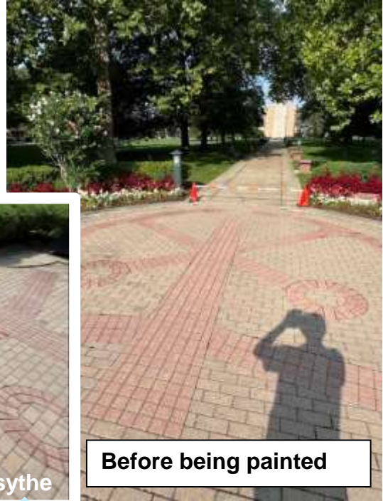
Before being painted

Since men paint with different pressures, the same paint appears in a variety of shades. The problem is solved by men painting a random number of bricks. The effect is attractive and unifying.