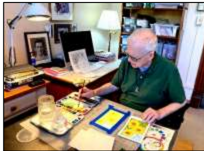
Watercolors and wood carvings