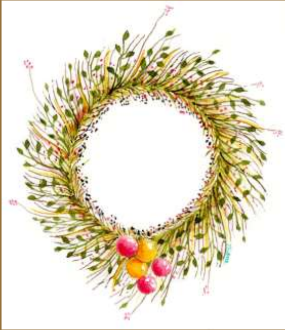
Christmas Wreath Watercolor