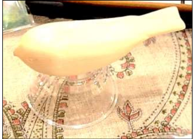
Small Bird Carving – a Comfort Bird that is held in hand