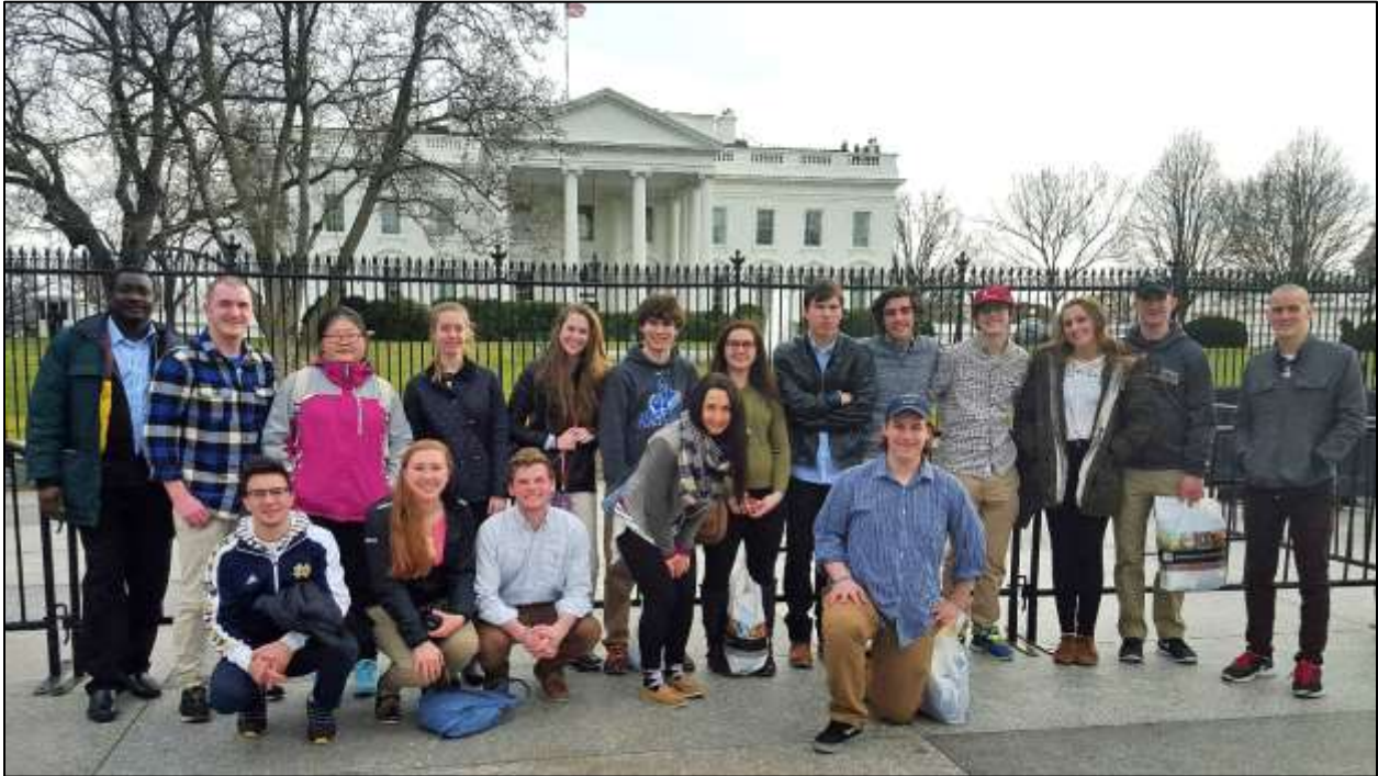
From Weekly GA Parent eNewsletter Week of February 29 – March 4