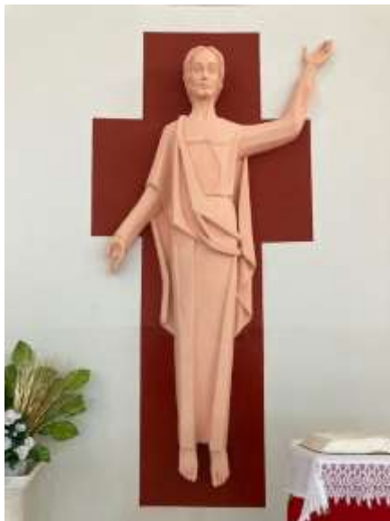
Banners in Saint Brother André Chapel at the Center.