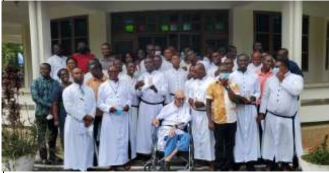
Brothers and sisters after mass in a group photo with the longest serving missionary in the district