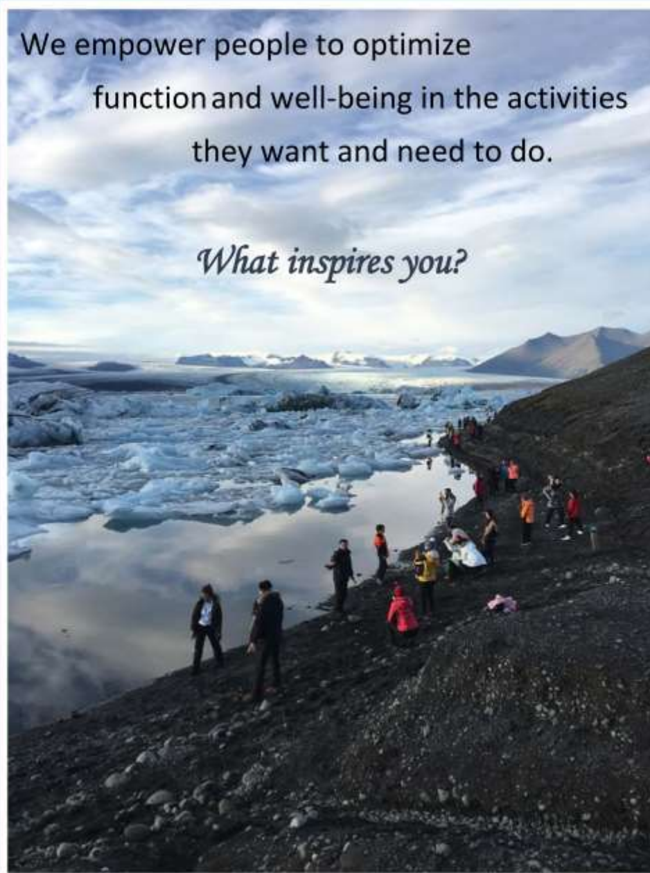
taken during a recent trip to Iceland.

THIS REFLECTION IS COURTESY OF MISSION, PEOPLE & ETHICS PROVIDENCE HEALTH CARE, VANCOUVER, BRITISH COLUMBIA www.providencehealthcare.org