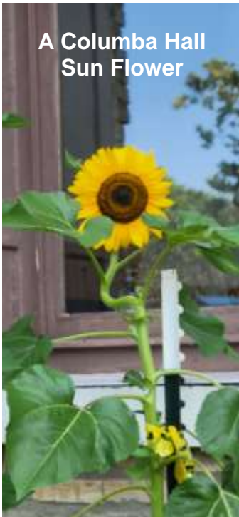
A Columba Hall Sun Flower