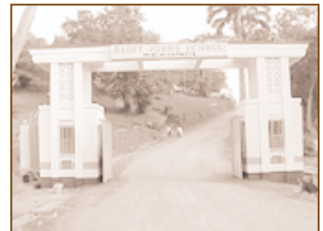
Jubilee Gate at the entrance to St. John's School.