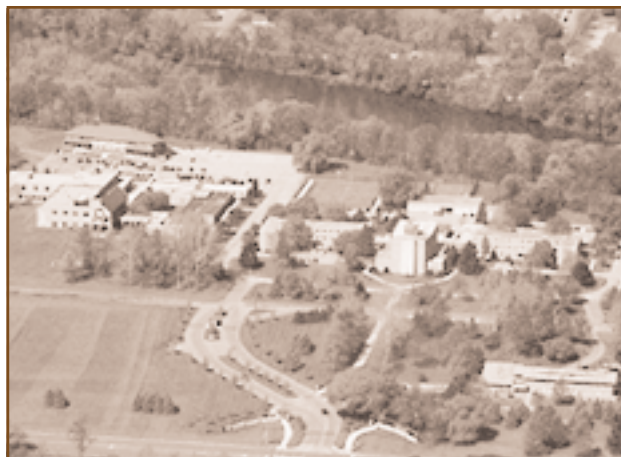
Aerial view of Holy Cross College