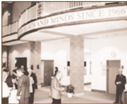
Vincent Hall Atrium, Holy Cross College

Whether pursuing a two-year or a four-year degree, future students at Holy Cross College can be certain their experience will be one in which their minds and hearts will be engaged. It's a Holy Cross tradition.