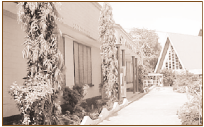
St. John's School Administration Building and Chapel