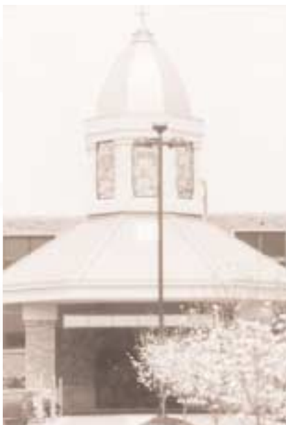
Hoban's golden dome provides a visible link to Notre Dame and Holy Cross Heritage.