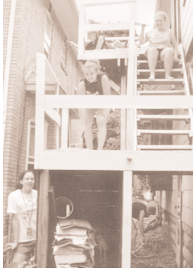
Hoban girls paint a fire escape as part of the JAM 2000 ministry to inner-city Akron.