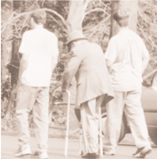
Two Hoban seniors walk with an Alzheimer’s patient at a nursing home. Their service projects bring them in direct contact with the people being served.