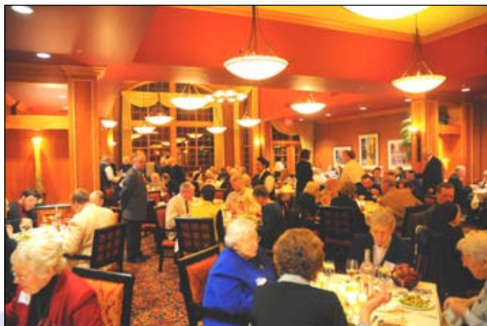
The dinner honoring Blessed Basil Moreau was held at Andre Place in Holy Cross Village at Notre Dame.