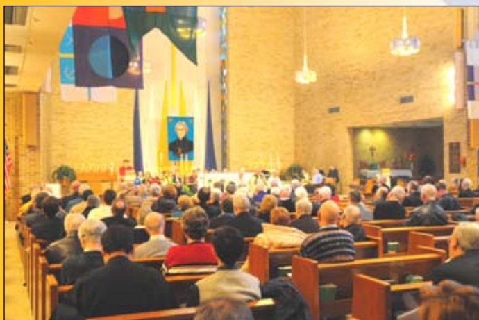
Prayer vigil held in St. Joseph Chapel, Holy Cross Village, January 18 in honor of Blessed Basil Moreau.