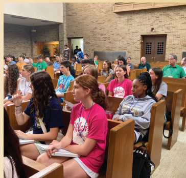
Students attending the Holy Cross Conference for Student Leaders had time to grow spiritually through prayer services.

Please use the enclosed envelope to make your thoughtful gift or contact: