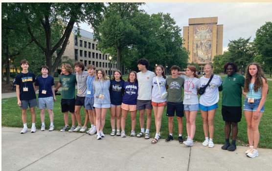
A group of students attending the Holy Cross Conference for Student Leaders get their photo taken with the famous "Touchdown Jesus" as a backdrop. Students were from Holy Cross schools in the Midwest and East.