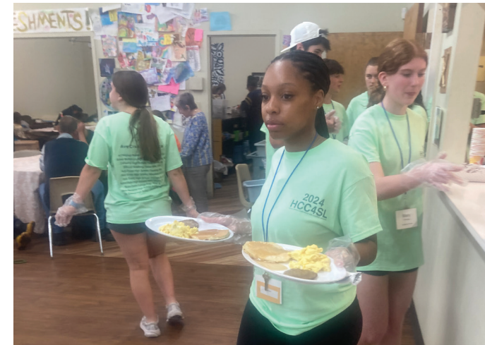
Students from Gilmour and Hoban served breakfast at Our Lady of the Road Mission Center for the unhoused and food insecure. The center offers breakfast every morning as well as clothes, laundry service and haircuts to those in downtown South Bend. Groups from each high school completed service projects one morning in different locations around town.