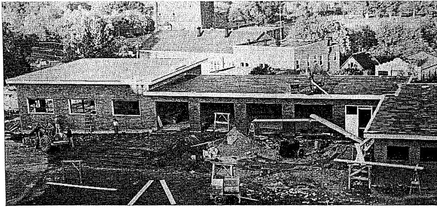
The ranch house atop Allingtown hill.