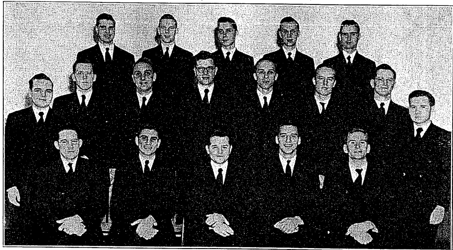
From the Watertown Juniorate, Wisconsin

Friends and relatives who attended the reception enjoyed an informal buffet lunch in the Chapter Room of the Novitiate, and visited with the novices until late afternoon.