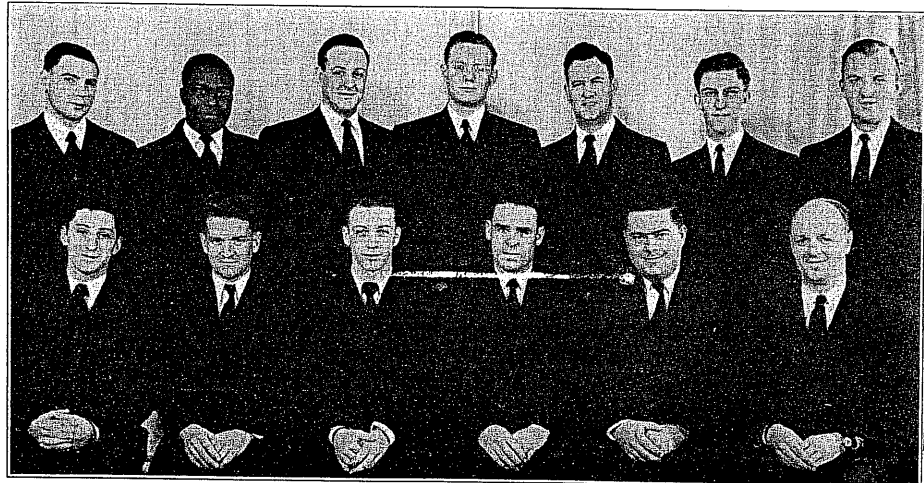
From the Valatie Juniorate, New York