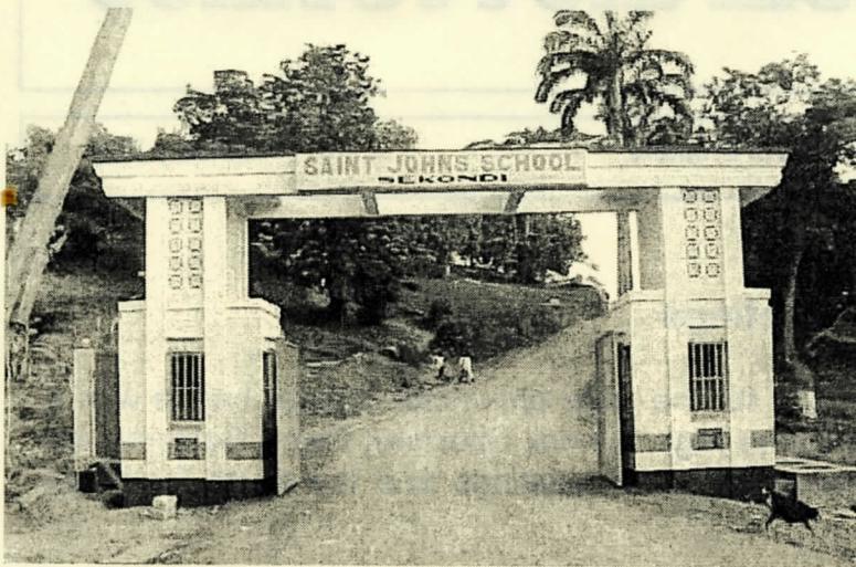
Jubilee Gate at the entrance to St. John's School