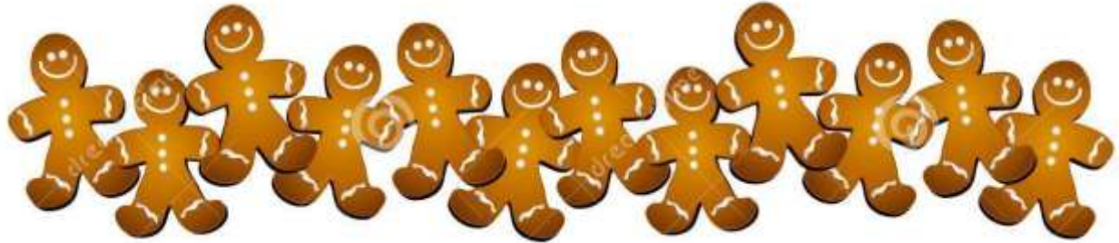
Christmas Mass followed by dinner at Columba Hall