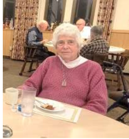
Dinner with caroling completed the evening.