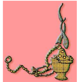
Drawing by brj

"... you have approached Zion the city of the living God and countless angels in festal gathering." Hebrews." 12:22