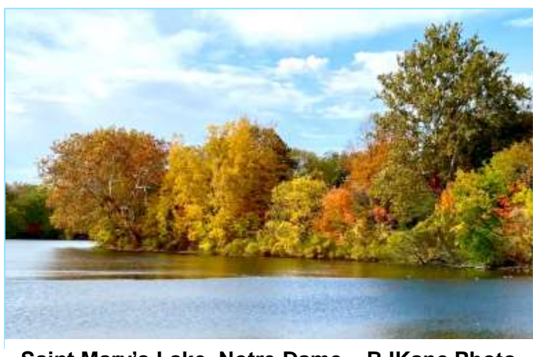
Saint Mary's Lake, Notre Dame

Psalm 19-1 The heavens declare the glory of God; the skies proclaim the work of his hands. Day after day they pour forth speech; night after night they display knowledge. There is no speech or language where their voice is not heard.