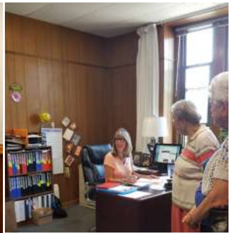
A visit with the Columba Hall nurse