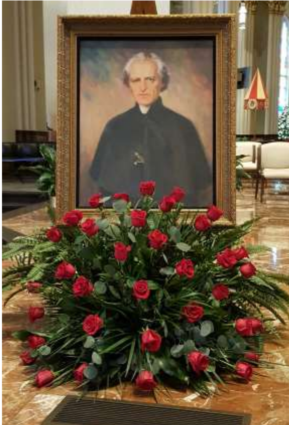
Photo taken at Sacred Heart Basilica