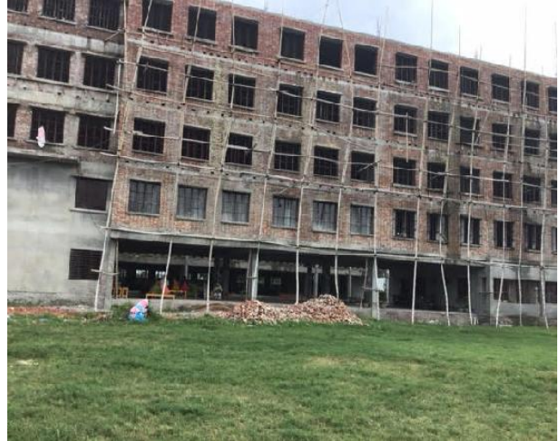
Exterior of School