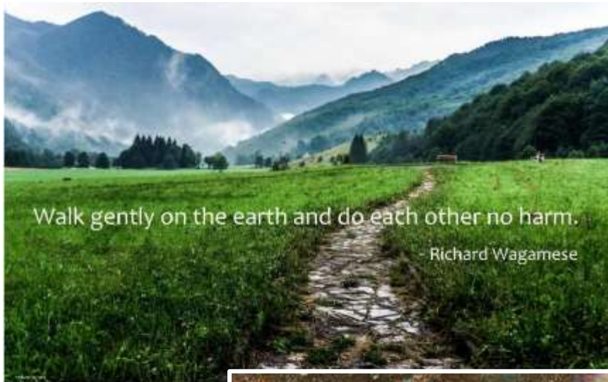
Emmanuel Care....With you on you