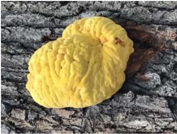
Two Foot Wide Fungus

We should have left these outdoor hangings for Halloween.