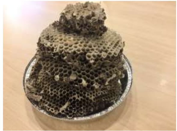
“Three Layer Cake”