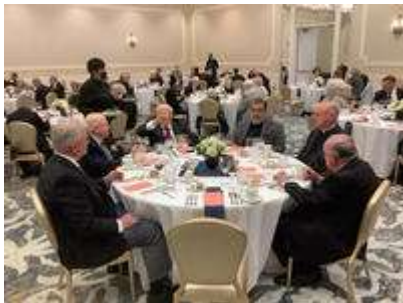
October 15, 2021