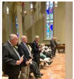
Renewal of Vows