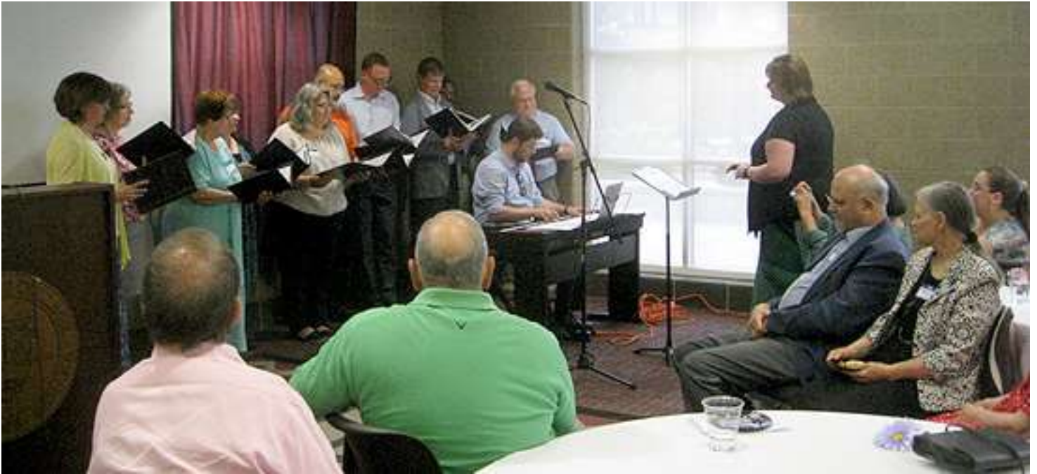
Saint Joseph Church Choir