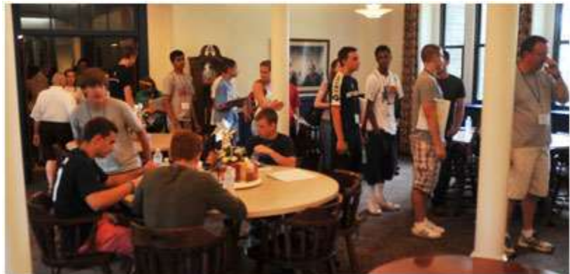
Lunch at Columba Hall

Off-campus activities included a visit to the South Bend Chocolate Factory, St. Mary's College, The South Bend Silver Hawks, Bruno's Pizza, Notre Dame Bookstore and South Bend service projects.