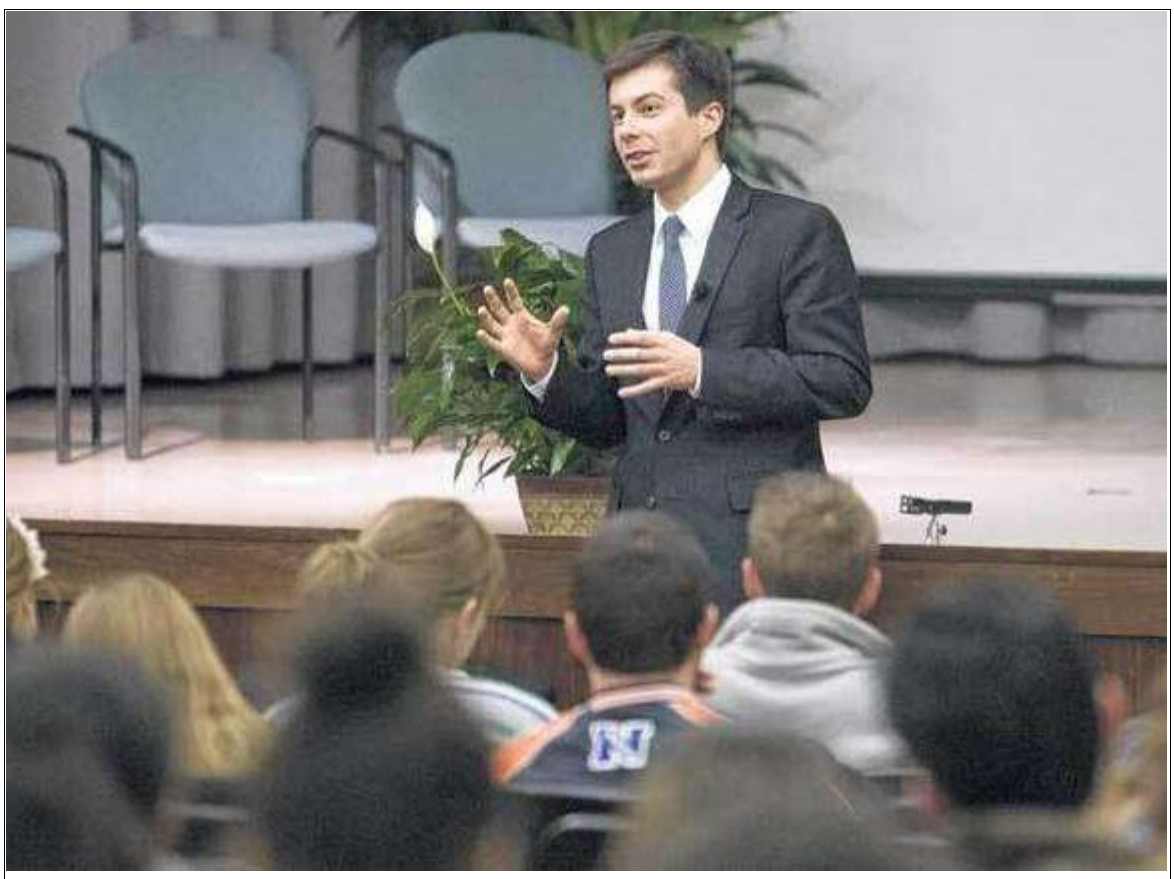
South Bend Mayor Pete Buttigieg speaks to Holy Cross students, faculty and visitors about success at an early age inside Driscoll Hall auditorium on the campus of Holy Cross.

South Bend mayor speaks about success at early age.