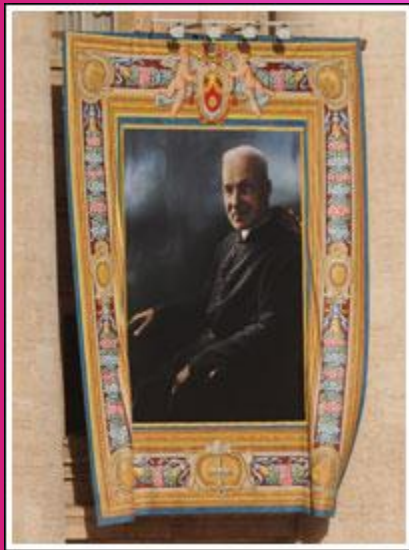
Saint André Bessette