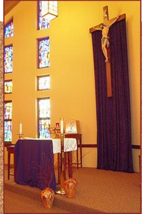
Pictures are of the Welcome table, the heritage book, the ambo, altar and crucifix.