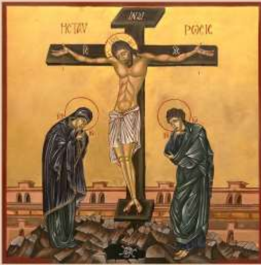
Featured image: Anastassia Tess Cassidy, Crucifixion (2022). Egg tempera and gold leaf on wood, 24 x 24 in.