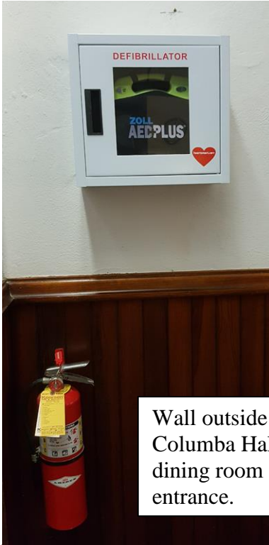
Wall outside Columba Hall dining room entrance.

Automated External Defibrillator (AED) Training An AED is used to resuscitate someone if s/he is unconscious, not breathing and/or having a heart attack.