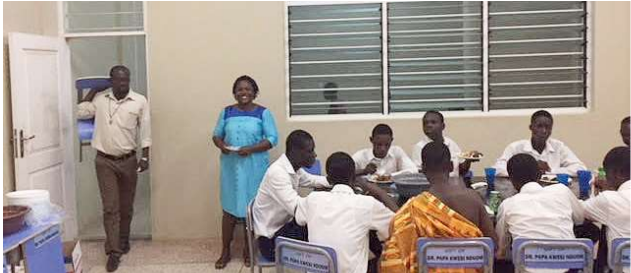
Classroom/dining room where we were hosted by the students following their Christmas performance.

students ten years ago with just six students the first year. The school now has an enrollment of over one thousand.