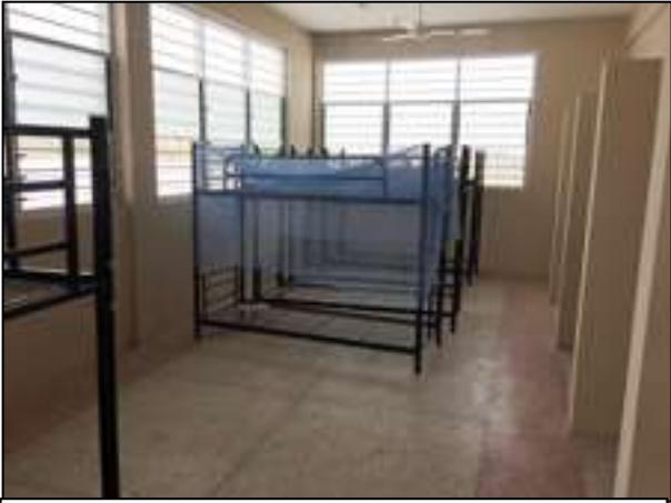
Dorm Room – Sleeps Eight