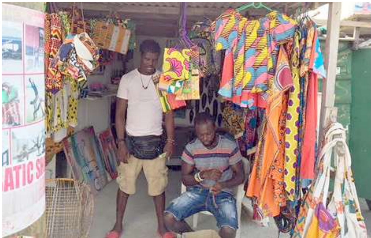
Shop area located in the open market area.