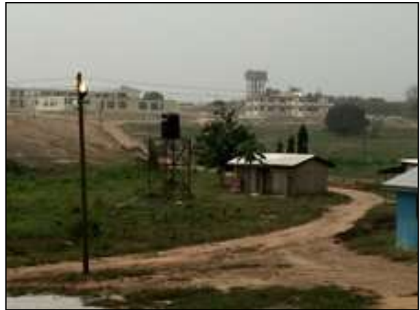
School and Dormitory from Other Dormitory