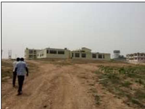
School and Girls Dorm