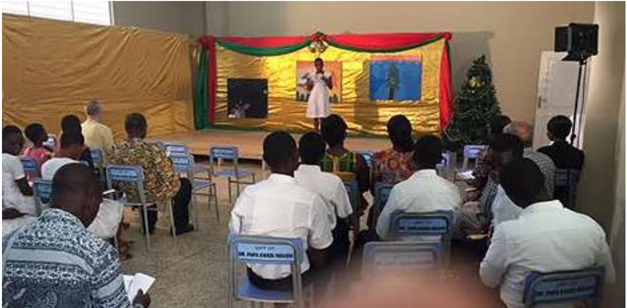
Christmas performance presented to faculty, staff and the neighboring Holy Cross Sisters who founded Holy Cross Academy for early childhood and elementary