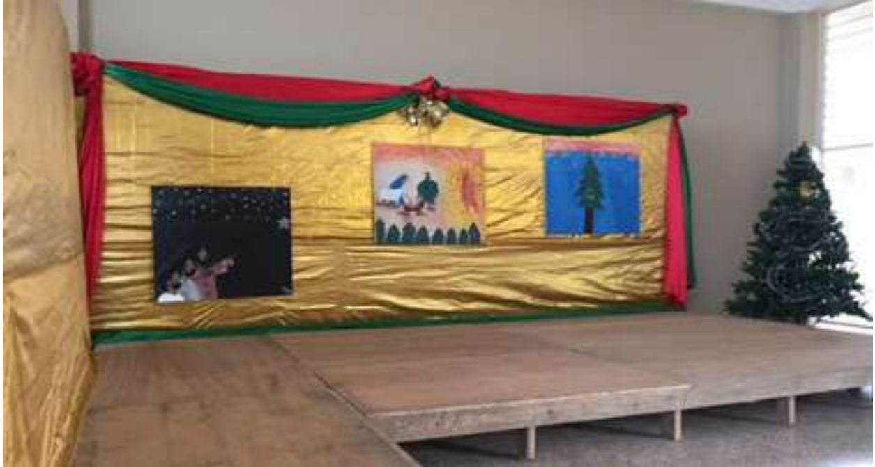
A classroom that was made to accommodate the student's' Christmas pageant and chorus performance.