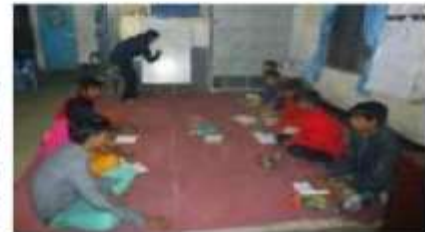
Patients attending a class at Mirpur ODIC

Outreach Drop In Centres: APON has two ODIC (Outreach Drop In Centres) near the Mirpur Mazar and the staff goes to various spots from Tongi/airport railway stations to Shadarghat/Wise Ghat in old Dhaka and Kamlapur railway station to Mohammadpur area to help youngsters in need of services like awareness of drugs, dealing with a drug using problems, health, hygiene, basic education, some skill training and a lot of loving care and attention, etc.