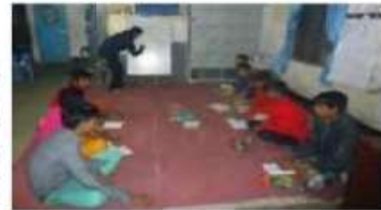
Patients attending a class at Mirpur ODIC

Outreach Drop In Centres: APON has two ODIC (Outreach Drop In Centres) near the Mirpur Mazar and the staff goes to various spots from Tongi/airport railway stations to Shadarghat/Wise Ghat in old Dhaka and Kamapur railway station to Mohammadpur area to help youngsters in need of services like awareness of drugs, dealing with a drug using problems, health, hygiene, basic education, some skill training and a lot of loving care and attention, etc.