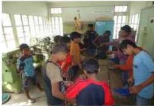
Little patients receiving technical training

Participation in Training Conference: A few staff and the Director participated in training conference both in Dhaka and Malaysia and Bangkok. One such meaningful training was “Training of Treatment Practitioners from Bangladesh, India and Pakistan on Child Drug Addiction Treatment”. This is a new training and fills a bit of the gap in assistance that is to be used for children. We were surprised and encouraged to find out that the expert participants from India and Bangladesh who visited our facilities recognize the type of Children's Program that APON has is unique for both countries.