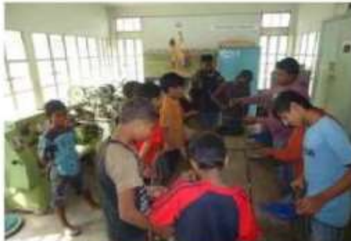
Little patients receiving technical training

Participation in Training Conference: A few staff and the Director participated in training conference both in Dhaka and Malaysia and Bangkok. One such meaningful training was “Training of Treatment Practitioners from Bangladesh, India and Pakistan on Child Drug Addiction Treatment”. This is a new training and fills a bit of the gap in assistance that is to be used for children. We were surprised and encouraged to find out that the expert participants from India and Bangladesh who visited our facilities recognize the type of Children's Program that APON has is unique for both countries.