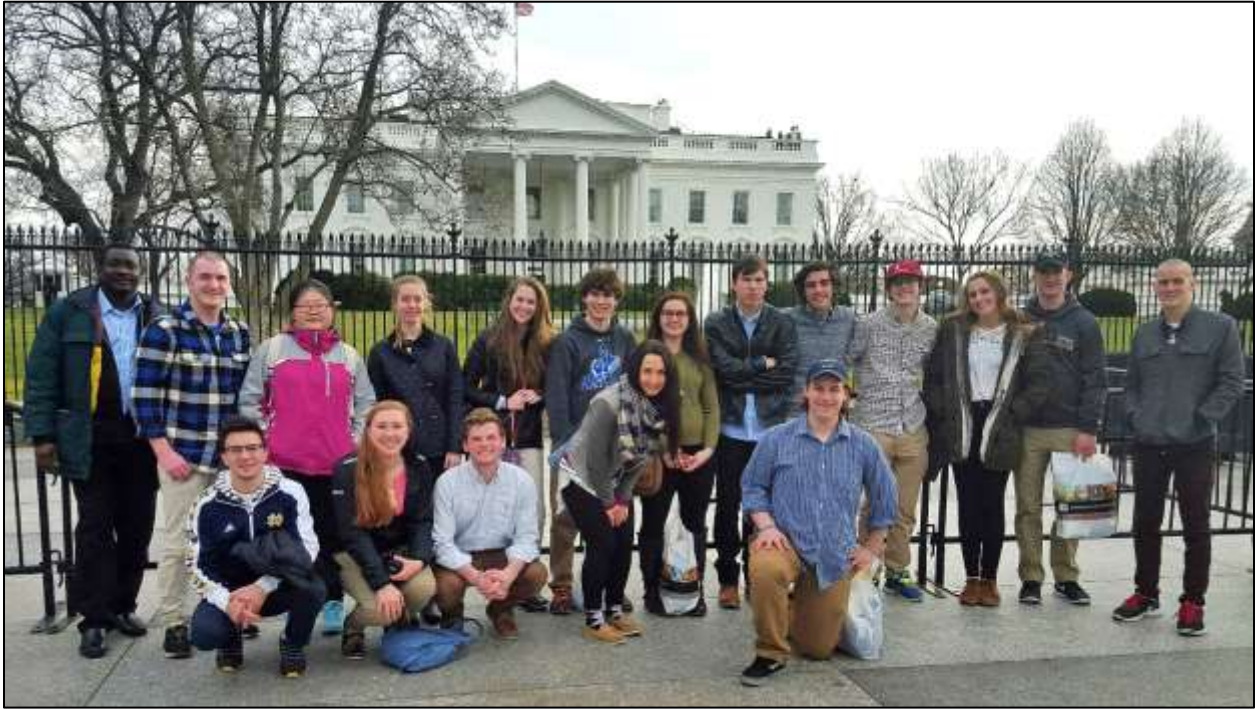
From Weekly GA Parent eNewsletter Week of February 29 – March 4