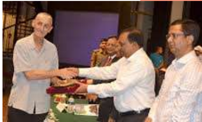
Home Minister and others at the stall where we had to give out awareness material at the function, 26 July 2017.