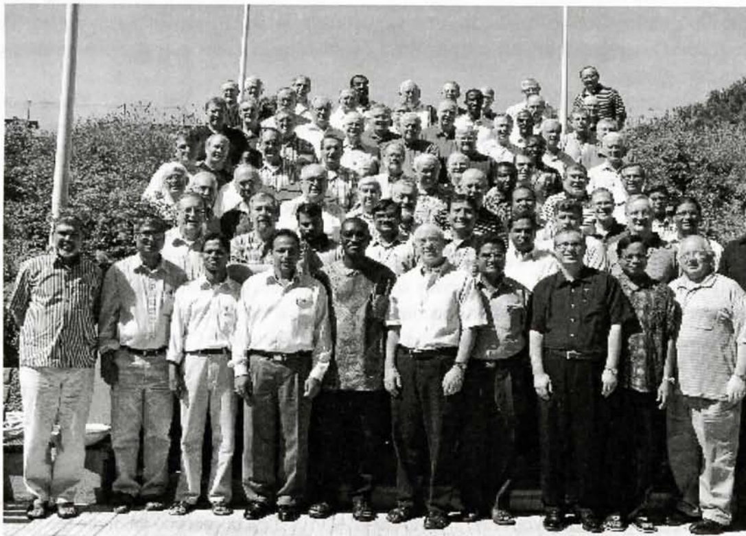
General Chapter Participants