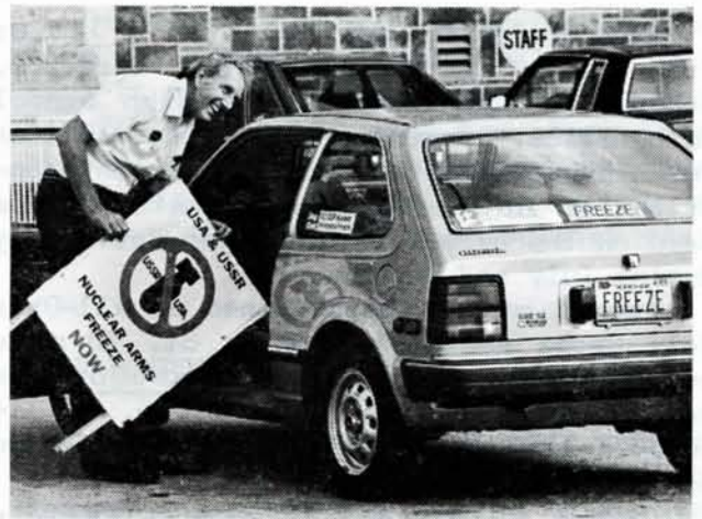
BROTHER MEWES PUTTING WORDS INTO ACTION

It was Randall Forsberg, often considered the founding mother of the freeze movement, who called Bill's attention to